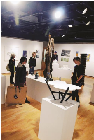
Raspberry Monday Art Exhibit